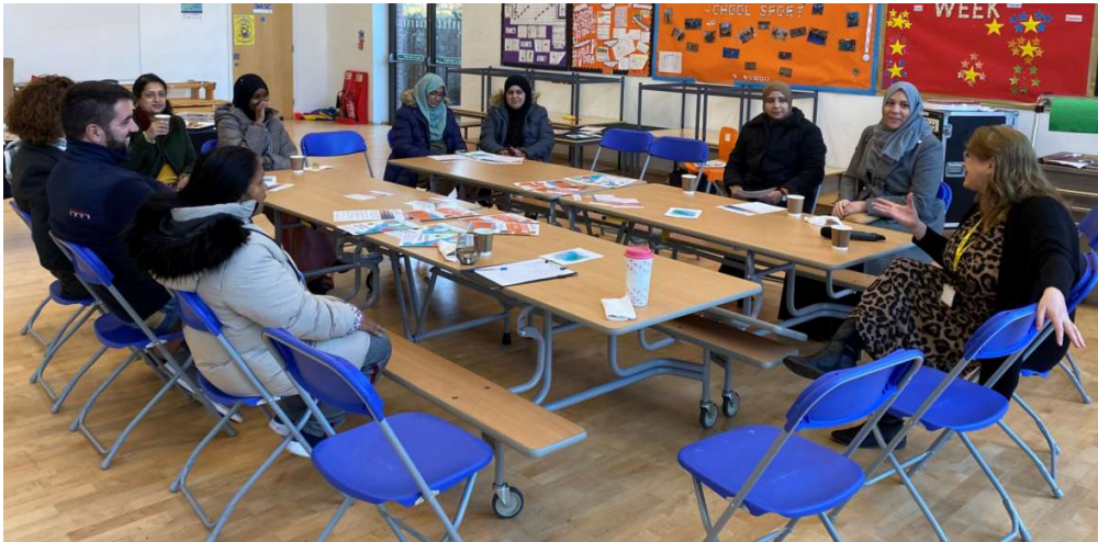
Parent coffee mornings with specialist guest speakers