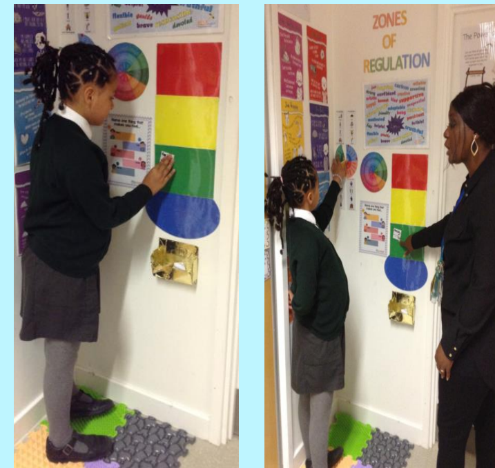
One to one intervention on emotional regulation helps children identify emotions that they feel in different situations and strategies to support them manage these feelings.