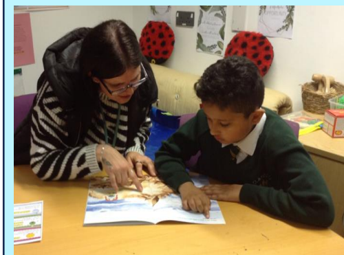
One to one sessions on building self-esteem helps children build their confidence not only in the classroom but in social situations.