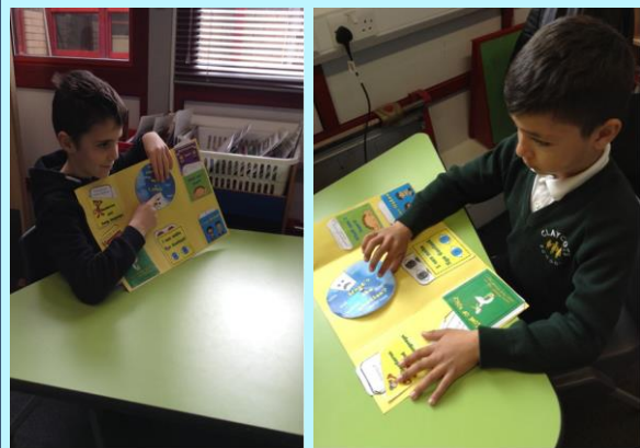
Attention & Listening intervention: To improve the capacity for pupils to focus on an activity for an extended period.