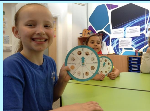
Friendship intervention helps children identify the qualities of positive friendships, what a friend is and helps the children to start new friendships and maintain them.