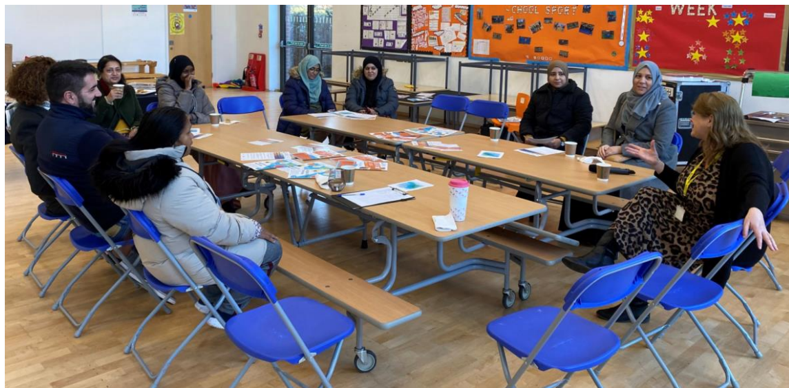
Parent coffee mornings with specialist guest speakers