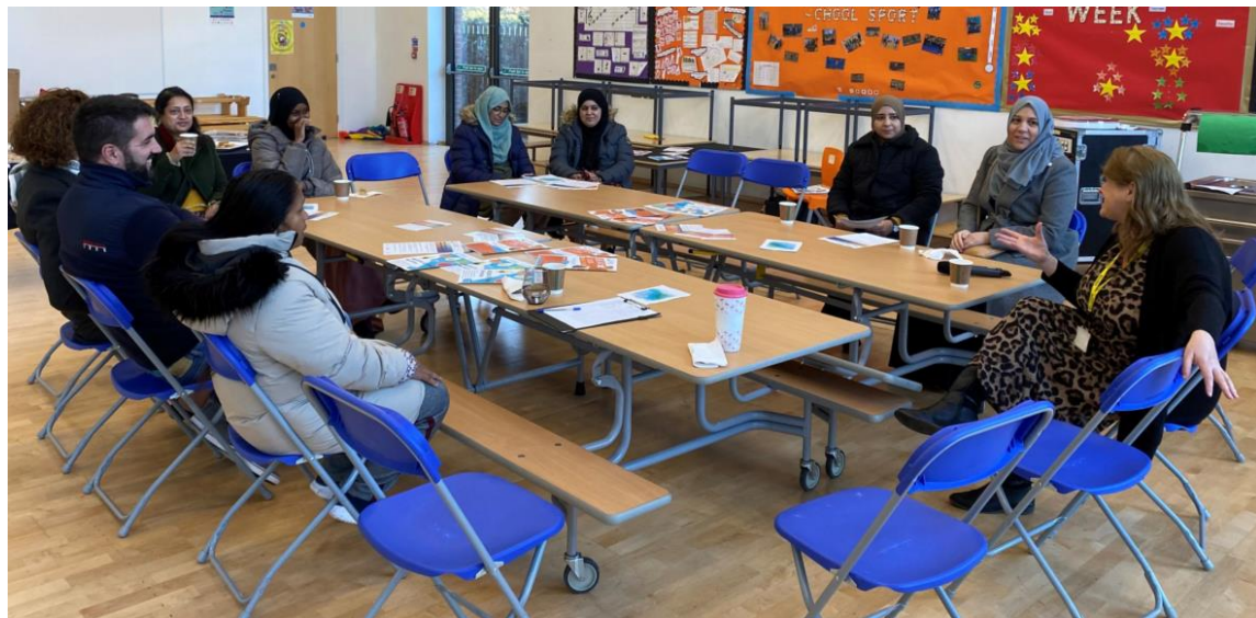
Parent coffee mornings with specialist guest speakers